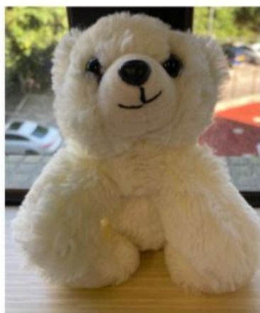
Blizzard Avni Bajaj 6F