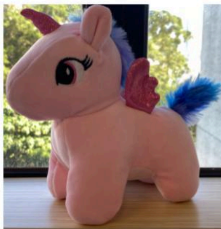
Lunabelle Kaydence Lo 1T